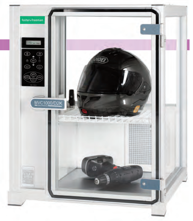
The MVC1000/D2K with dual temperature glue heater